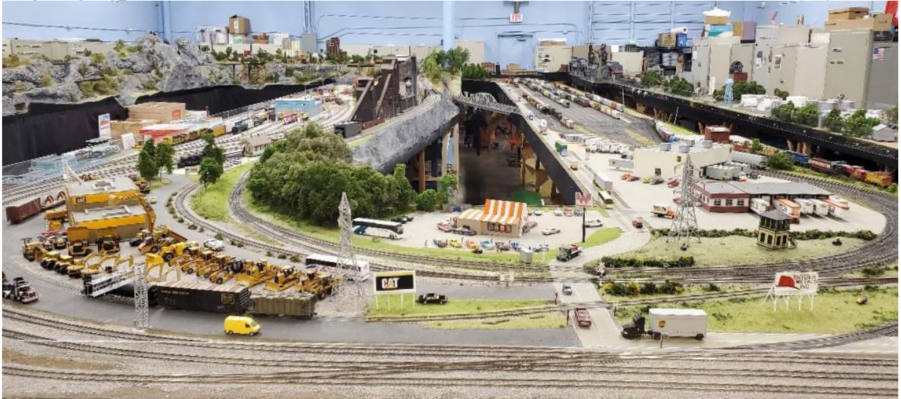
Above: Overall view of the giant, 3,000 sq. ft. TNMRR Club's HO-scale layout. To the right are some of the lockers members can rent.