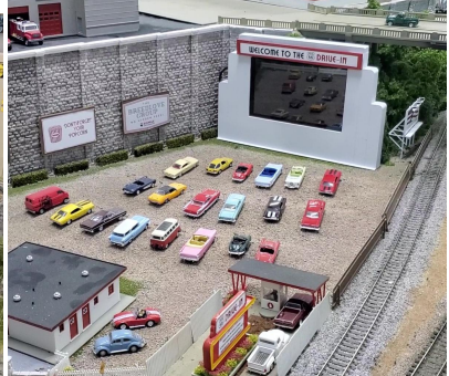
Above: (Left) A busy city scene with plenty of tall buildings, and even one under construction. (Middle) Some rough terrain with a curved wood trestle and lots of rocky cliffs. (Right) This drive in movie has an actual picture show playing on the screen!