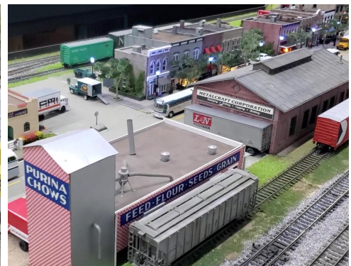
Above: (Left) This molten metal car dump display is lighted to look like red hot slag pouring out, and is part of a giant steel mill complex. (Middle) Intermodal yard with overhead container crane in action. (Right) A good example of one of the many industrial sidings available to make the club's operating sessions interesting. That Purina Chows building looks familiar.